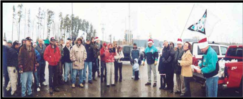
December 15, 2006. Members of CEP 37x gather to receive bags of groceries, grocery gift cards and some much needed Christmas cheer from union locals across the province.